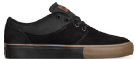
BLACK/GUM | 10023 Suede/Canvas