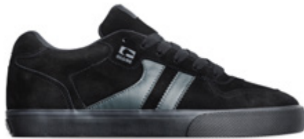
BLACK/NIGHT | 10864 Suede/Synthetic Leather