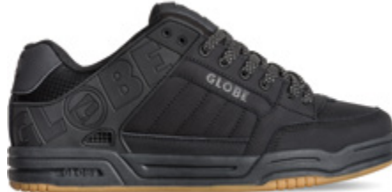
DARK SHADOW/PHANTOM | 15252 Action Nubuck/Synthetic Nubuck/Textile/TPR