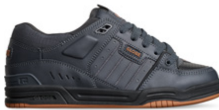
PHANTOM/BURNT ORANGE | 15328 Action Leather/Synthetic Leather