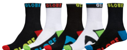
GB41239009_ASS | Assorted 75% Cotton, 22% Nylon, 3% Elastane