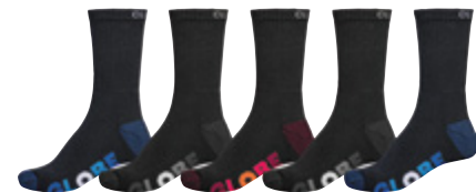
GB41429001_BLK | Black/Assorted 75% Cotton, 22% Nylon, 3% Elastane