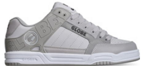
TRIPLE GREY | 15245 Action Nubuck/Synthetic Nubuck