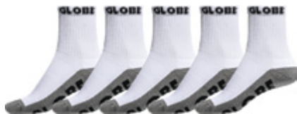
GB3-70901_BLKWHT | Black/White 75% Cotton, 22% Nylon, 3% Elastane