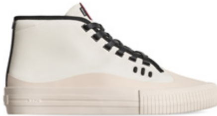
CREAM/BLACK | 11755 Waxed Canvas/Synthetic Leather/Mesh