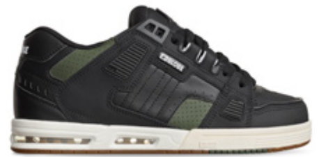
BLACK/COMBAT | 20607 Action Nubuck/Synthetic Leather