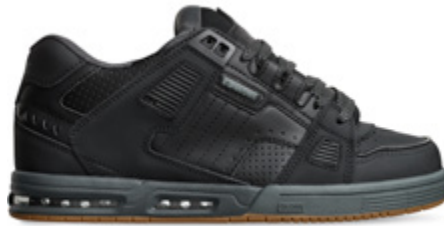
DARK SHADOW/PHANTOM | 15252 Action Nubuck/Synthetic Leather