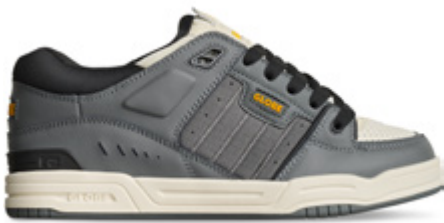
LEAD/ANTIQUE | 15317 Action Leather/Synthetic Leather