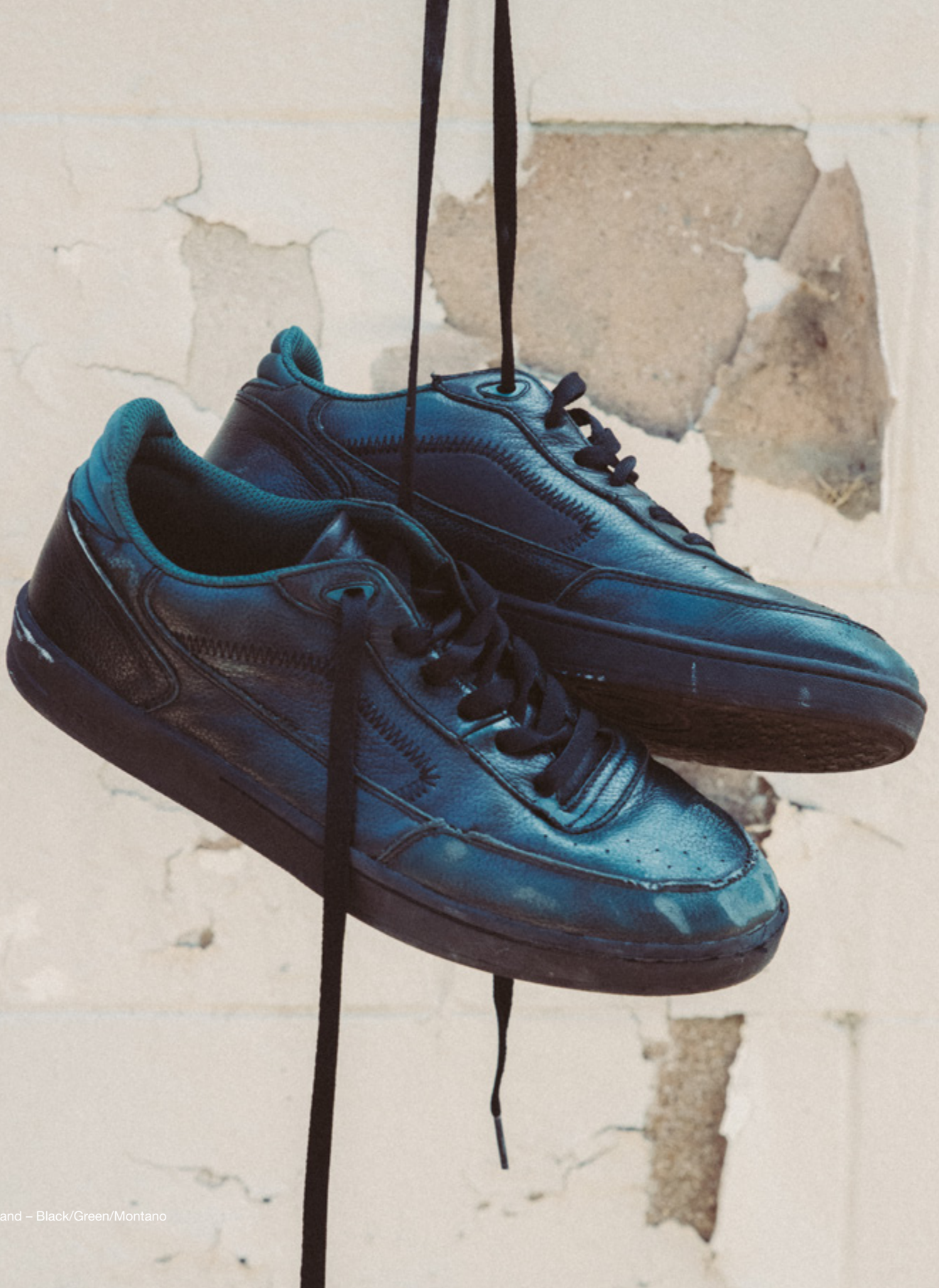
The Holand – Black/Green/Montano