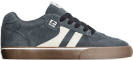
LEAD/GUM | 15323 Suede/Synthetic Leather