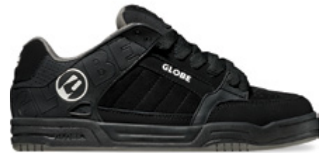
BLACK/BLACK TPR | 10894 Action Nubuck/Suede/TPR/Synthetic Suede