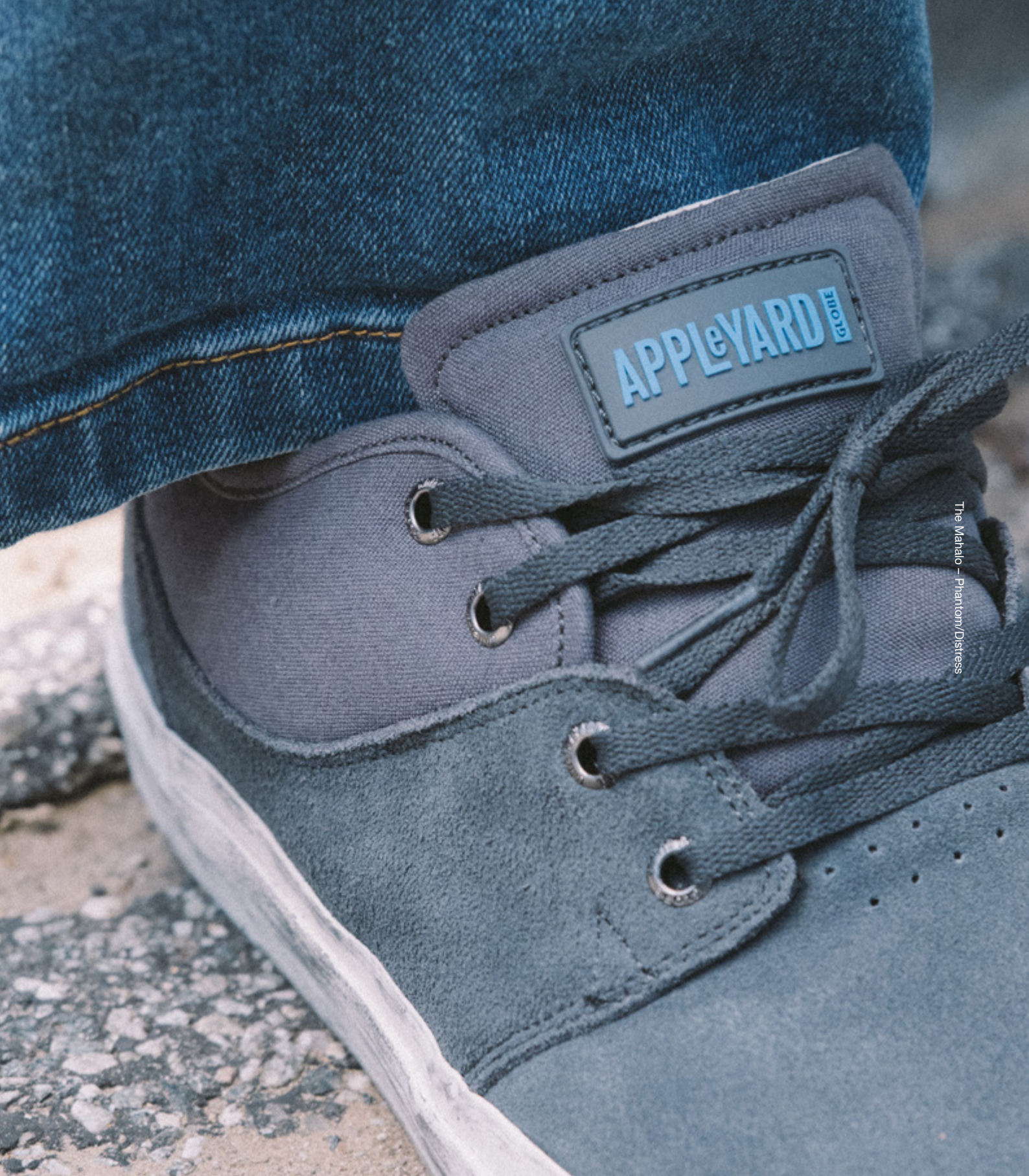
The Mahalo - Phantom/Distress