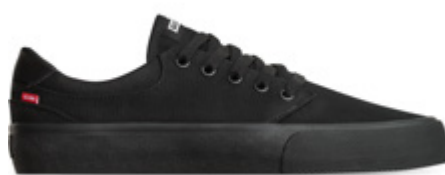
BLACK/BLACK | 10006 Canvas