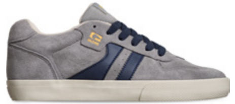
SMOKE/NAVY | 15333 Suede/Canvas/Synthetic Leather