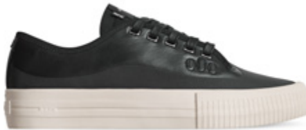
BLACK LEATHER | 10122 Leather/Synthetic Leather/Mesh