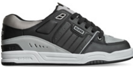
BLACK/STEEL/WHITE | 20610 Action Leather/Synthetic Nubuck