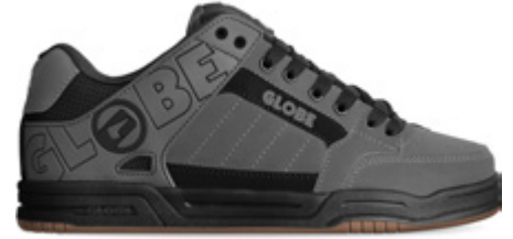
STORM GREY/BLACK | 15312 Action Nubuck/Synthetic Leather