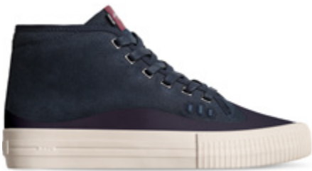
INK CORDED SUEDE | 13324 Corded Suede/Synthetic Leather/Mesh