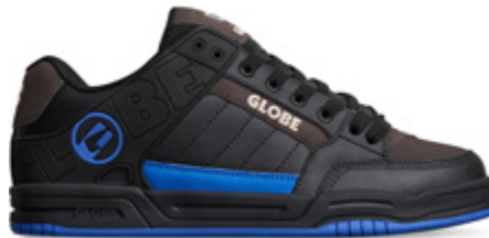
BLACK/TAN/COBALT | 20612 Action Leather/Synthetic Nubuck