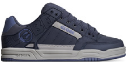
NAVY/DENIM | 13323 Action Nubuck/Synthetic Nubuck