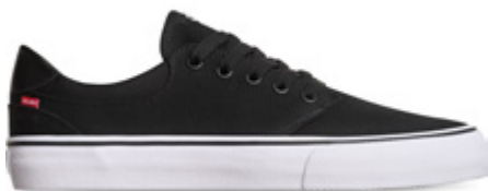
BLACK/WHITE | 10046 Canvas