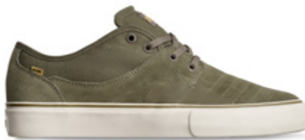
KHAKI/ANTIQUE | 16109 Suede/Canvas