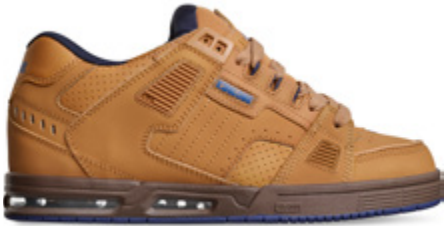
BURNT CARAMEL | 16373 Action Nubuck/Synthetic Leather