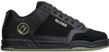
BLACK/OLIVE | 10522 Action Leather/Synthetic Nubuck/Ripstop