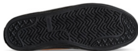
CHESTNUT/MAALOUF | 16376 Suede/Canvas