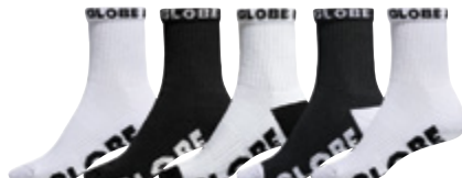
GB3-70901_ANKLE | White/Grey 75% Cotton, 22% Nylon, 3% Elastane