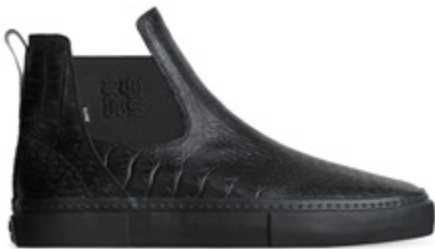
BLACK CROC/WASTED TALENT | 20615 Leather