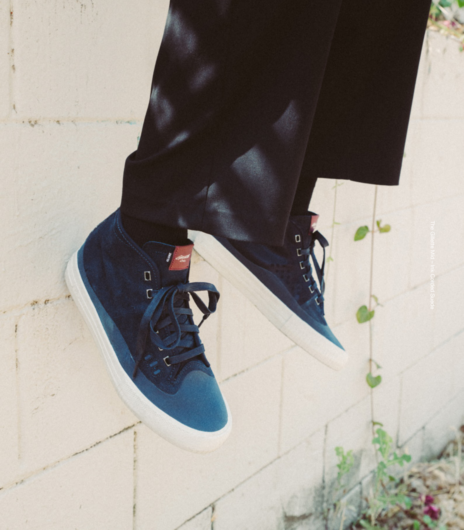
The Gillette Mid - Ink Corded Suede