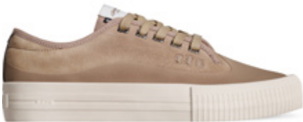
INCENSE/ANTIQUÉ | 29090 Suede/Synthetic Leather/Mesh