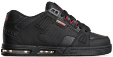
BLACK/DUSK | 20608 Action Nubuck/Synthetic Leather