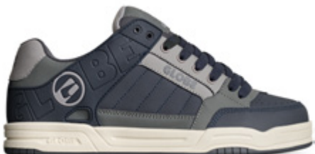
EBONY/CHARCOAL | 15325 Action Nubuck/Synthetic Nubuck