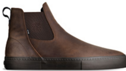
DARK BROWN/WASTED TALENT | 17342 Crazy Horse Leather