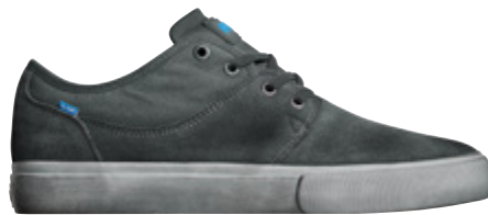
PHANTOM DISTRESSED | 15332 Suede/Canvas