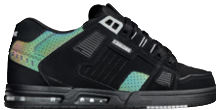
BLACK/OIL | 20551 Action Nubuck/Synthetic Nubuck