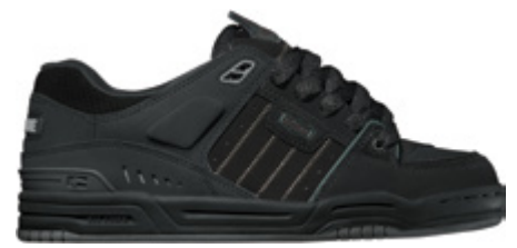
BLACK/NIGHT | 10864 Action Nubuck/Synthetic Nubuck