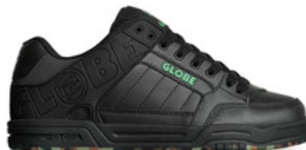
BLACK/GREEN/MOSAIC | 20609 Action Leather/Synthetic Leather