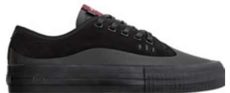
BLACK/BLACK SUEDE | 10811 Suede/Synthetic Leather/Mesh