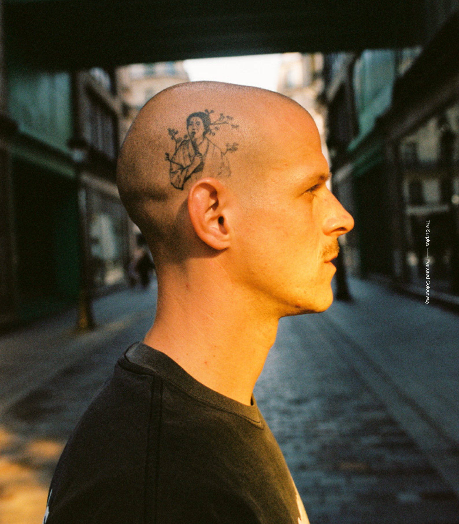
The Surplus — Featured Colourway