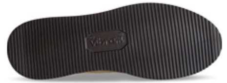
TAUPE/MSFT | 16377 Suede/Vibram