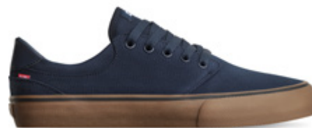
NAVY/GUM | 13030 Canvas