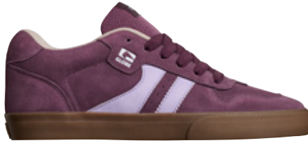
PLUM/GUM | 29011 Suede/Canvas/Synthetic Leather