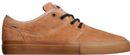
CLAY/GUM | 16375 Hairy Suede/Canvas