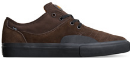
COFFEE/BLACK | 17355 Suede/Canvas