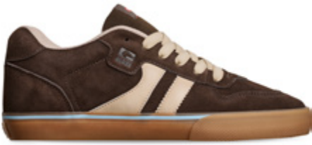
BROWN/GUM | 17002 Suede/Canvas/Synthetic Leather